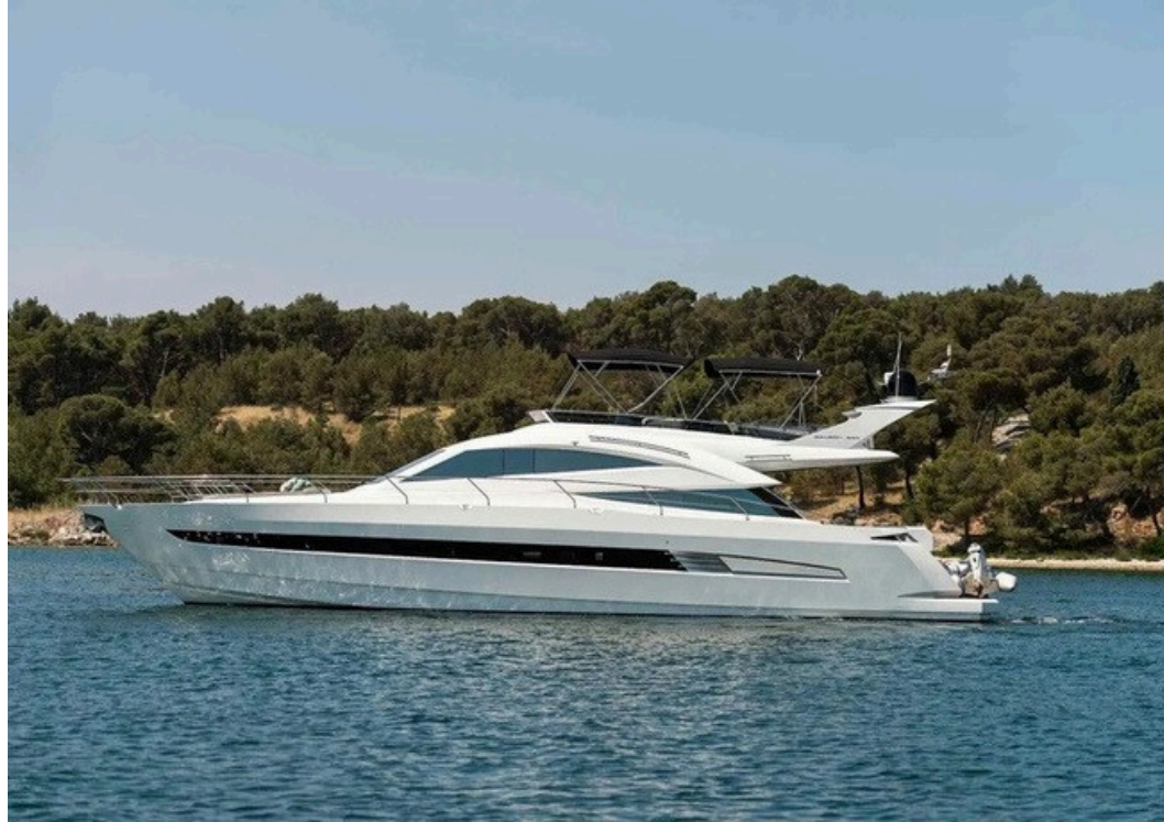
2008 Galeon 640 FLY EXTERIOR